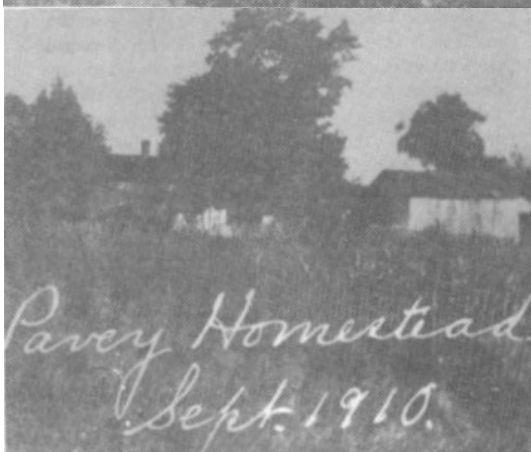
Pavey Homestead Sept. 1910.