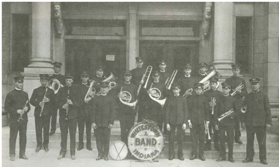
Whitestown Band, Boone County, Indiana, c. 1916