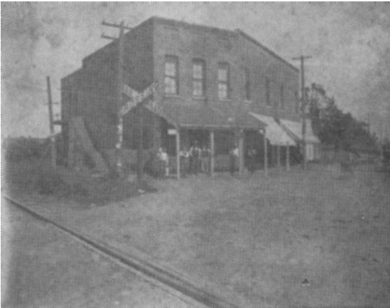
Laughner Drugstore at the northwest corner of Main Street and the railroad tracks, Whitestown, Boone Co., Indiana